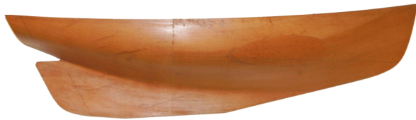
Model #204 By Nathanael G. Herreshoff

Capt. Nat's hand written description of the H-20 model.